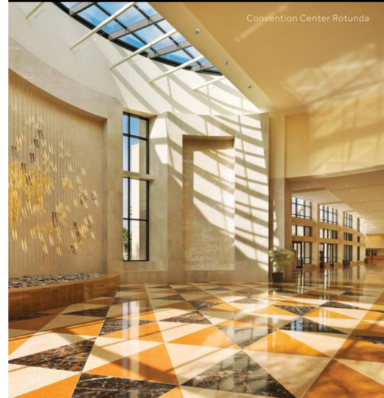
Convention Center Rotunda