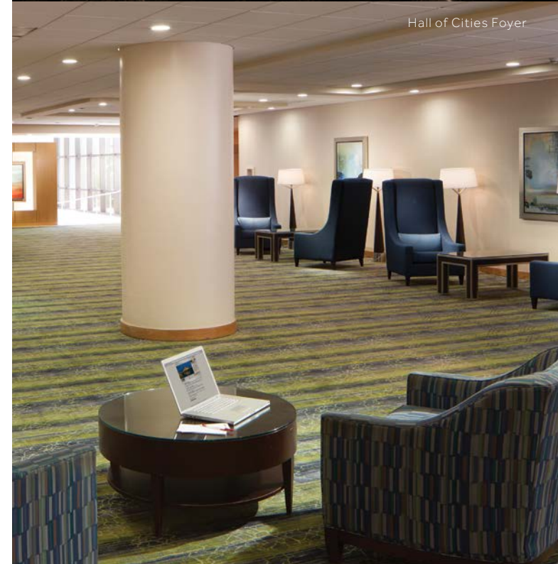
Hall of Cities Foyer