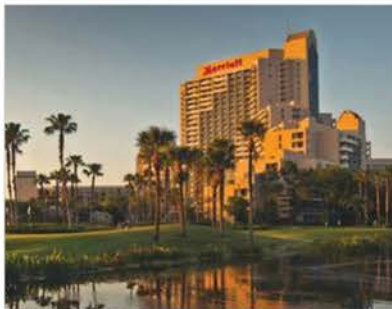
Orlando World Center Marriott

lion-dollar renovation. The 2,009-room hotel offers more than 450,000 square feet of meeting and event space.