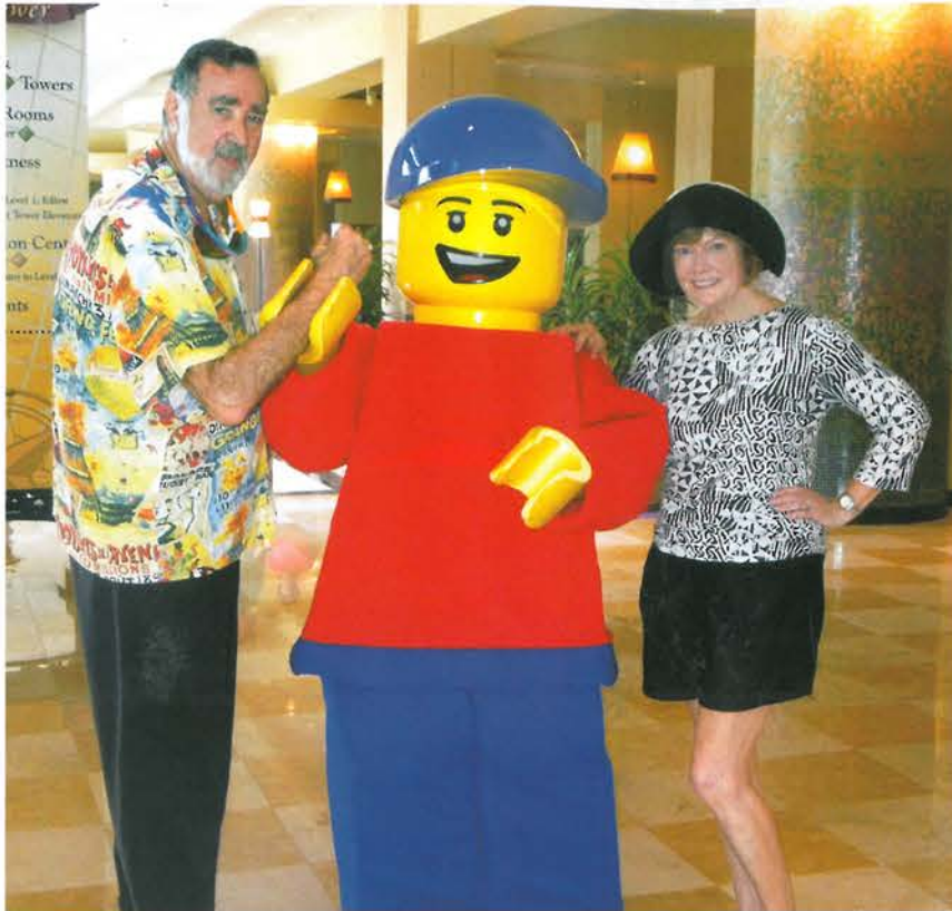
You never know what celebrating you might see at the Marriott World Center.