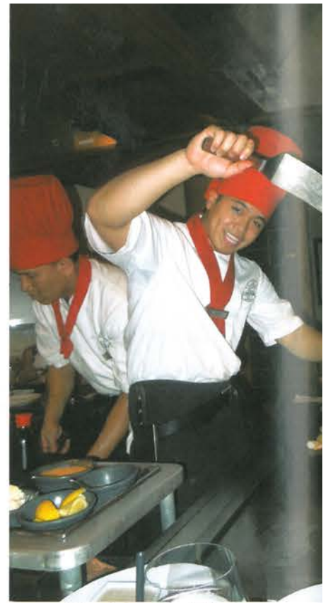
The chefs at the Mikado Restaurant become showmen as they prepare your meal.