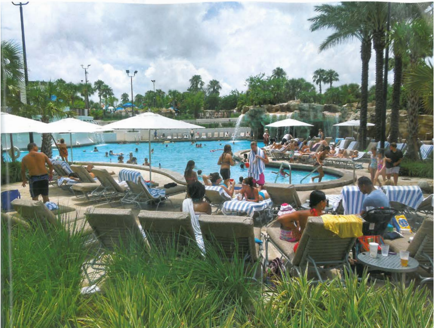
The gigantic, multi-level pool area encourages relaxation.