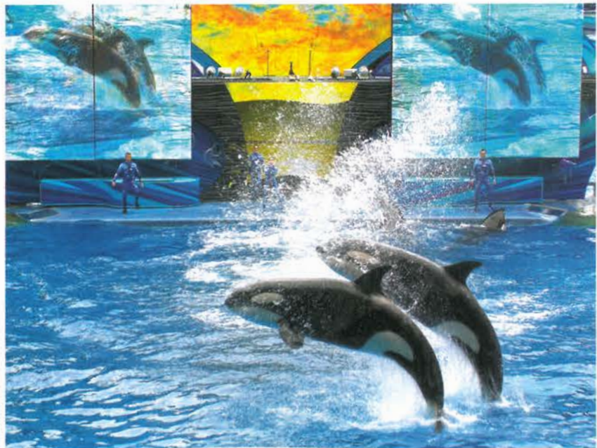
The killer whale show at Sea World is a splashy spectacular.