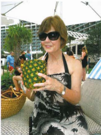
Enjoying drinks poolside can be exhausting.